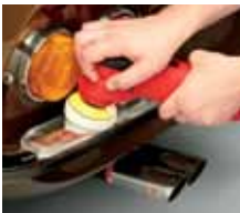
Perfect on chrome and other metal surfaces!