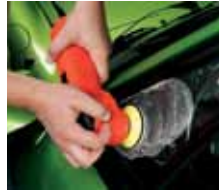
Remove water spots, streaks and grime from glass.