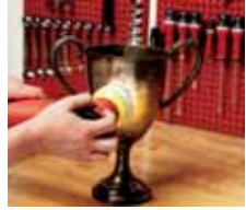
Use it around the home and garage.