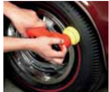
Quickly clean areas with road grime, dirt & grease.