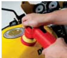
Great for motorcycle detailing.