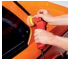
Easily polish or wax smaller areas on your vehicle.