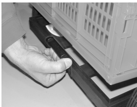
Figure 6 - Clip crate onto cart.

8. To install the crate onto the chassis hook one bottom end lip of the basket (either end) under the front lip of the chassis (nearest the handle). You should always clip the front end first. Once the front end is secured, push the crate straight down and it should snap into the clip at the rear of the chassis. To remove the crate, pull out on the rear clip and lift the back of the crate straight up. (Figure 6)