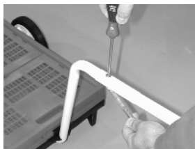
Figure 3 - handle assembly.