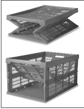
Figure 5 - Opening the crate.