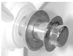
Figure 1 - Pal nut and washer assembly.