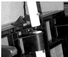
Figure 4 - lower handle assembly.