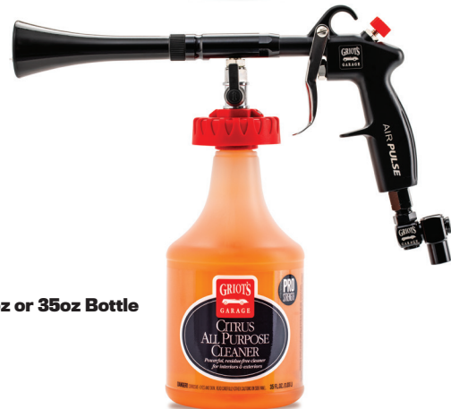
22oz or 35oz Bottle